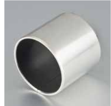
内外倒角 ID and OD chamfers